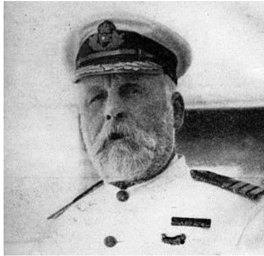
Edward Smith – Captain (died)

I was a highly experienced captain. In fact, I even helped to avoid a disaster in Southampton as the Titanic set sail! The size of the ship meant that when it moved forward, it sucked a smaller boat towards it. It was thanks to me that we swerved out of the way in time!